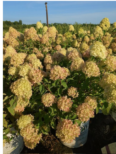
Hydrangea Little Lime