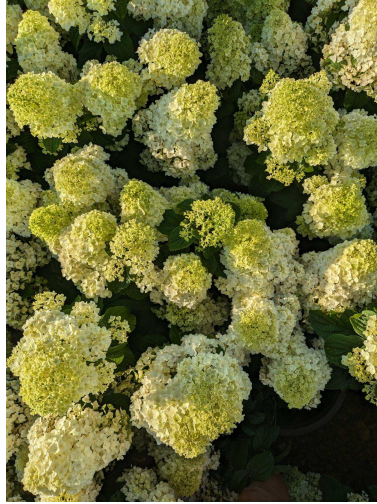
Hydrangea Little Hottie