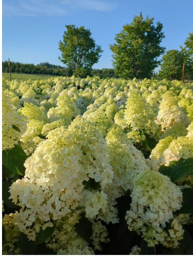
Hydrangea Little Hottie